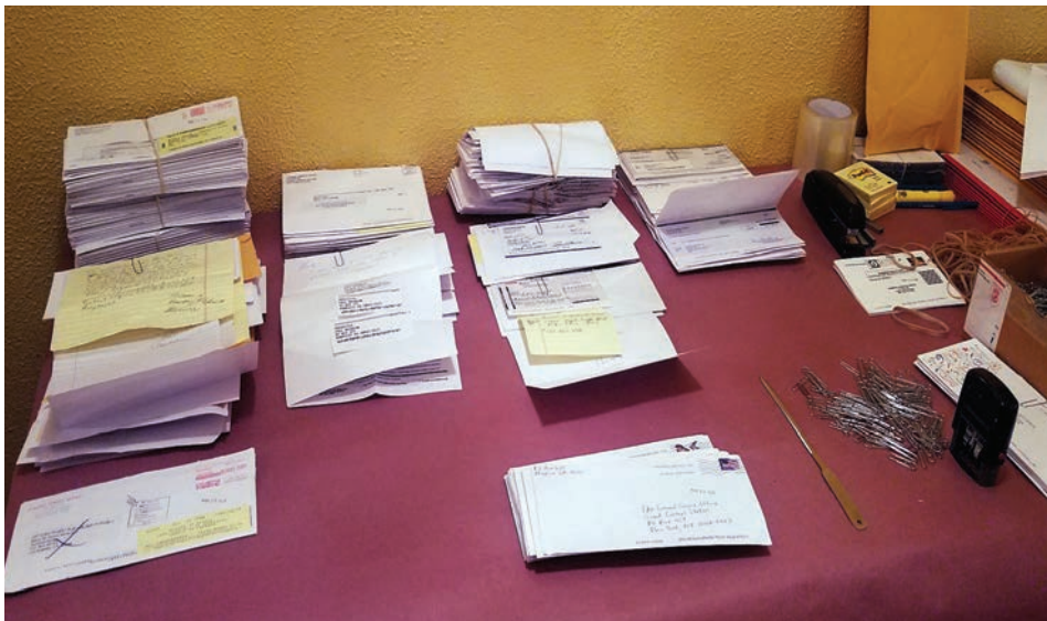
Temporary mailroom set up by the A.A.W.S. mail/shipping supervisor in his apartment in the Bronx. The daily mail includes literature orders, contributions, update correspondence and inmate mail.