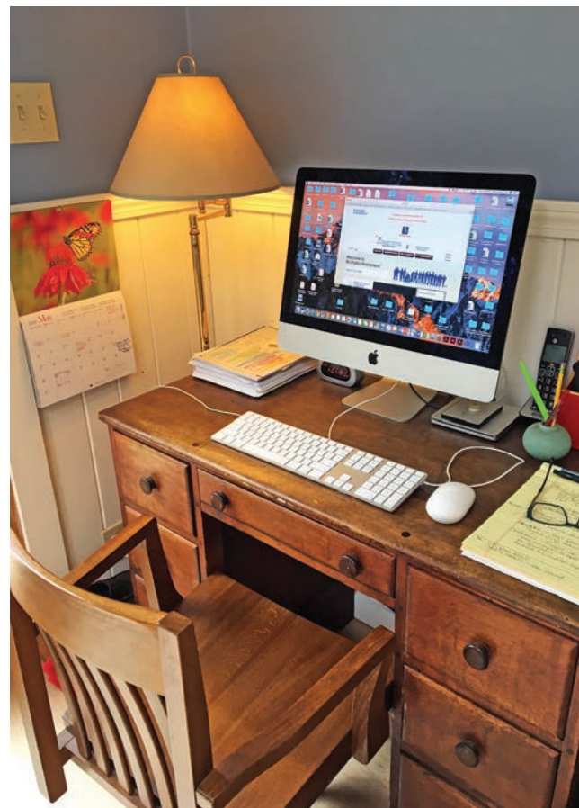
Teleworking from home — one employee’s set up, including secure access to the office-wide VPN (virtual private network).

Among the many current publishing projects moving forward is the 2020 catalog of Conference-approved literature and other A.A. material (with new, simplified pricing) — 110,000 copies of which have been printed to be inserted into all orders from A.A.’s literature warehouses. (It is also available as a PDF on aa.org ). Newly produced audio book recordings of the Big Book and